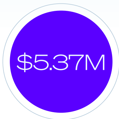
Median UK ransom demand in the last year.